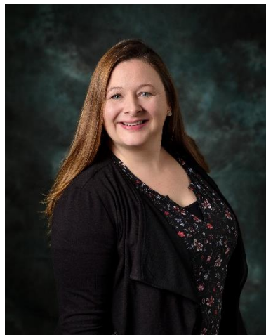
Deputy Mayor Coreen Pickering