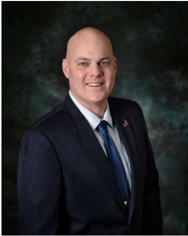
Mayor Jeff Spencer